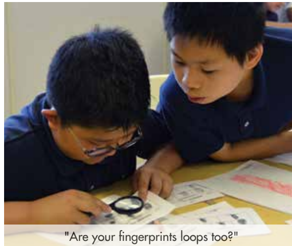
"Are your fingerprints loops too?"

“Giving students the opportunity to experiment, investigate, create and think critically about how things work in daily life is truly an unforgettable and authentic experience. I highly recommend this program.”