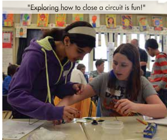
"Exploring how to close a circuit is fun!"

Explore solids, liquids and gases as detectives seeking clues to the mysteries of matter. Compare physical and chemical changes by carrying out some cool chemistry. Discover the work of some fascinating insect chemists. Determine the identity of a mystery compound using your chemical intuition and some crafty experimentation.