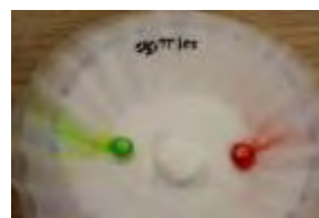
Set up of filters and sample results after one hour.